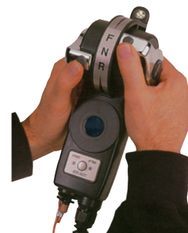
Optional hand held remote control