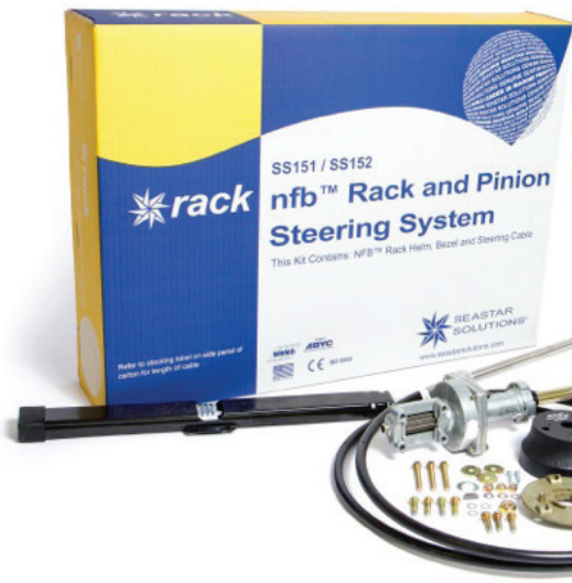
NFB™ Rack Single Cable System (Steering Wheel not included.)