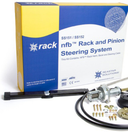
NFB™ Rack Single Cable System (Steering Wheel not included.)