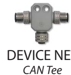
DEVICE NET CAN Tee

TERMINATOR REMOVED FROM LOWER STATION BUS TO 2ND STATION CONTROL HEAD TO 2ND STATION JOYSTICK TO 2ND STATION CANTRAK/BUZZER