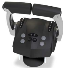
CONTROL HEAD Optimus 360