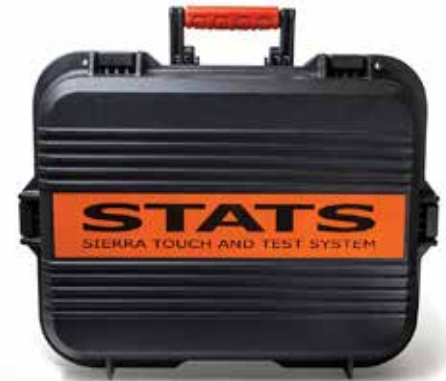
OPTIONAL HARD CASE

STATS® (Sierra Touch And Test System) is an innovative handheld engine diagnostic tool from Sierra. Now a marine technician can plug into a marine engine's Electronic Control Module (ECM) and diagnose problems without the need of a laptop or PC. Technicians will save time - and dealers make more profit - moving directly to the job, with one quick and easy to use diagnostic tool that covers multiple engine manufacturers. Technicians can even perform engine diagnostics while the boat is still in the water.