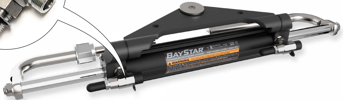
Figure A. Adjustable stainless steel O-ring seal (ORB) fittings.

The new cylinders will begin shipping in approximately February 2019 for all new orders leaving our Richmond, BC manufacturing location. When this occurs, the previous design (with NPT fittings) will no longer be available, Orders will be automatically changed to reflect the new part number.